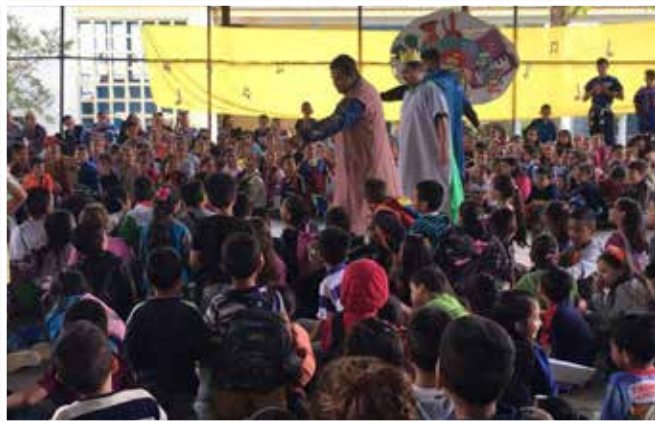
▶ Venezuela VBS in action