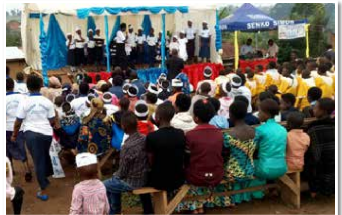
► Some of the participants in the TCI Meetings

distribution of food and clothing, visiting people who are in prisons and hospitals.