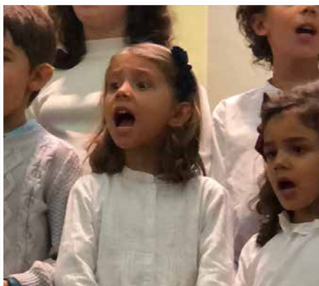
► Portuguese Children singing their hearts out!