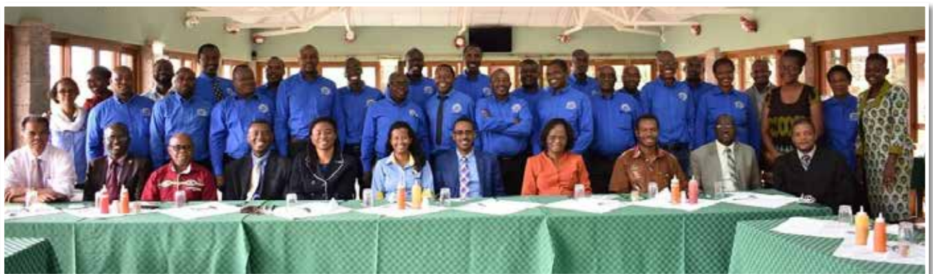
► MA in Chaplaincy Students at AUA together with some of their Professors and Staff

It is hoped that the Chaplains who went through the course are now better prepared to have some understanding in dealing with children and youth.