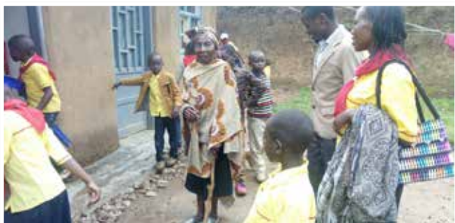
► Children doing the outreach and community service