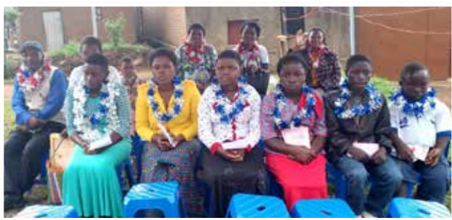
► In the front row are the six candidates who got baptized