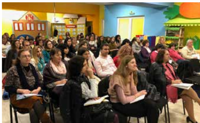
► Bulgaria Leadership Training

Sunday was the highlight of the weekend with about 100 children and teens attending the interesting children's outreach program called "The City of Promises." The first one was for the younger children while the second one was for the primaries and teens. There was a puppet show followed by the participation of children and teens at different stations such as the Health station, Fire Safety, Thinking and observation, etc. The children and teens were engaged in interactive activities that not only teach information, but they experienced it. It was a delight and the children and teens enjoyed it thoroughly. This was the third year they have done such outreach.