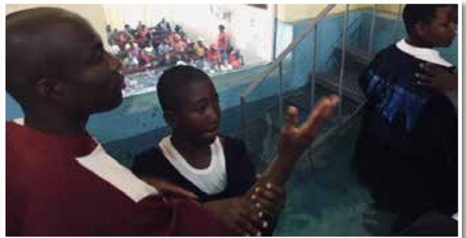
▶ Jamaica Union Year of the Child Baptism Celebration