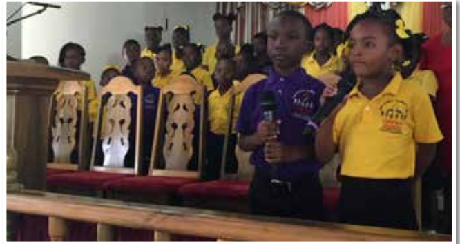
▶ Jamaica Union Year of the Child celebration

The afternoon was filled with an exciting children's program with songs, preaching, and mimes. Children were at the center of the entire weekend, following Jesus' calling to "suffer the children to come to Him."