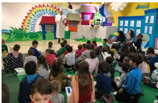
► Bulgarian Children Enjoying the "City of Promise" Outreach Activities